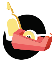
GLUE OR TAPE