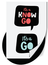
KNOWGO SIGN ART

How: Students either paste the KnowGO/GO logos from download, or draw their own unique "KnowGO" & "GO"